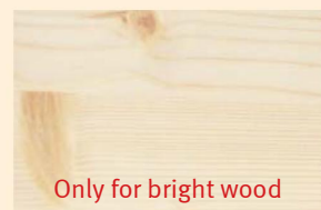
Only for bright wood