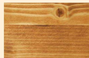
Teak No. 102-81