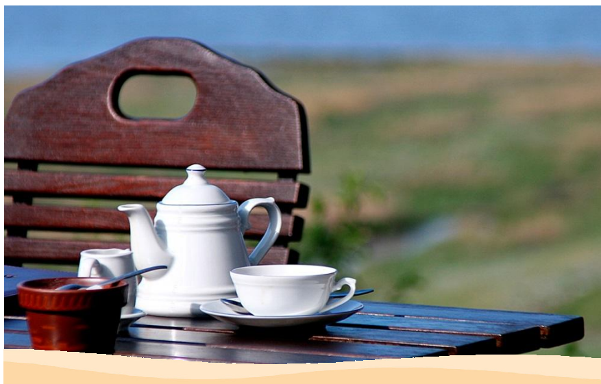
Natural (pigmented white) No. 102-92