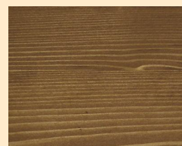
Bangkirai No. 110-85