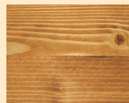
Teak No. 110-81