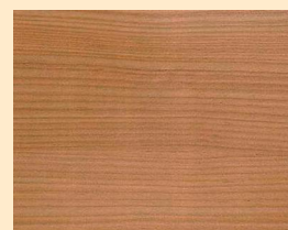
Larch No. 110-89