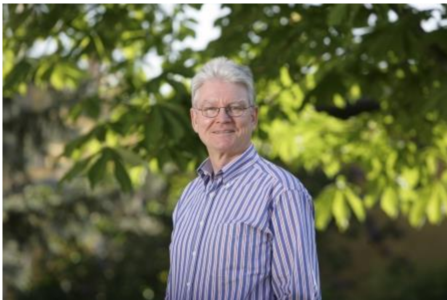
AURO founder and author