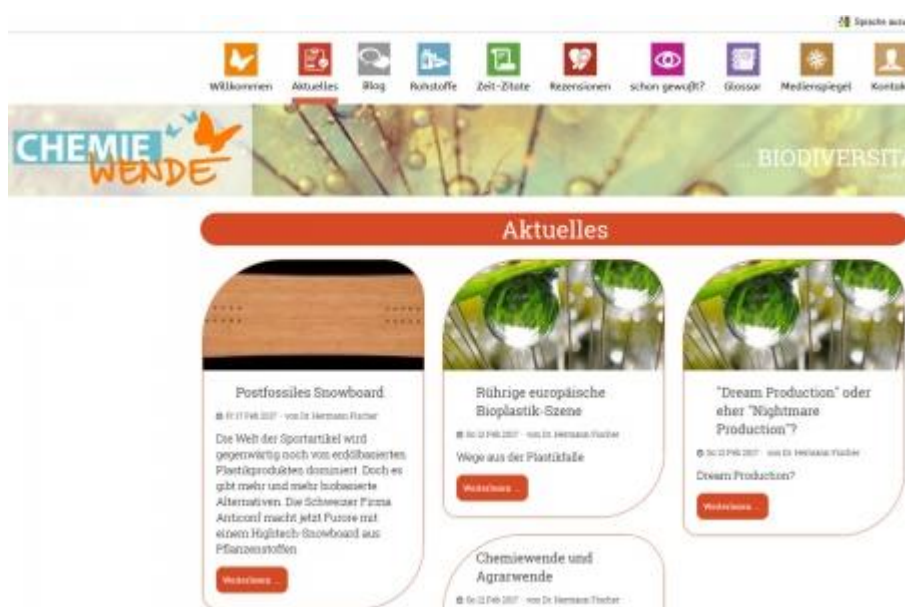
The new platform for a future chemistry?